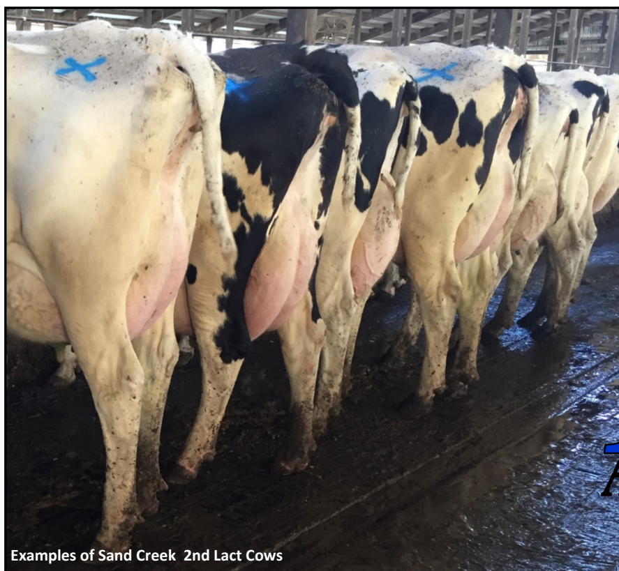
Examples of Sand Creek 2nd Lact Cows