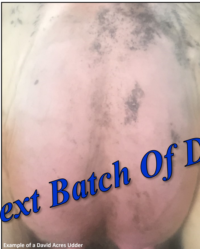
Example of a David Acres Udder