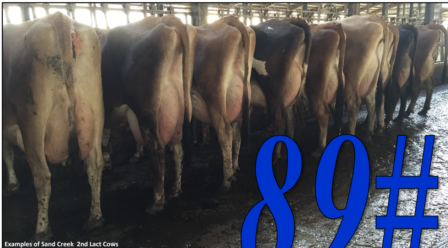
Examples of Sand Creek 2nd Lact Cows