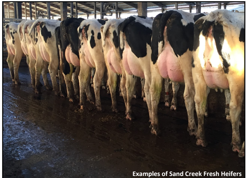
Examples of Sand Creek Fresh Heifers